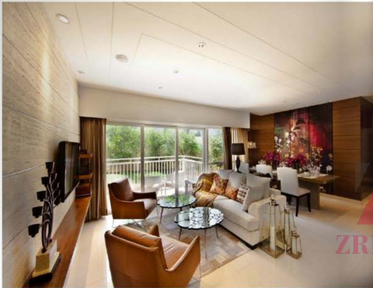
Living Room at the Show Suite