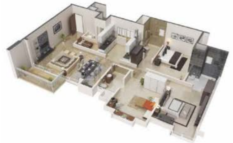
Above: 2 Bedroom Home Below: 3 Bedroom Home